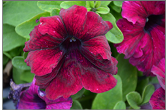
Success! HD Burgundy Petunia flowers

Success! HD Burgundy Petunia is recommended for the following landscape applications;