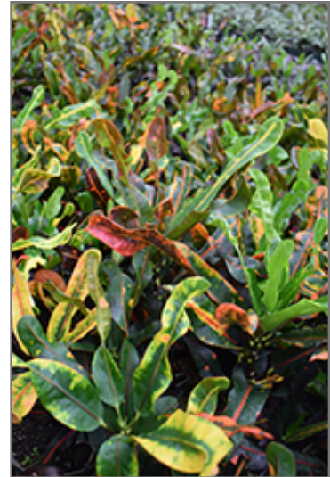
Mammy Croton in full

This is a dense herbaceous evergreen houseplant with an upright spreading habit of growth. Its wonderfully bold, coarse texture is quite ornamental and should be used to full effect. This plant should not require much pruning, except when necessary to keep it looking its best.