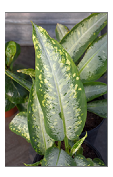
Panther Dieffenbachia foliage

When grown indoors, Panther Dieffenbachia can be expected to grow to be about 5 feet tall at maturity, with a spread of 3 feet. It grows at a medium rate, and under ideal conditions can be expected to live for approximately 10 years. This houseplant performs well in both bright or indirect sunlight and strong artificial light, and can therefore be situated in almost any well-lit room or location. It does best in average to evenly moist soil, but will not tolerate standing water. The surface of the soil shouldn't be allowed to dry out completely, and so you should expect to water this plant once and possibly even twice each week. Be aware that your particular watering schedule may vary depending on its location in the room, the pot size, plant size and other conditions; if in doubt, ask one of our experts in the store for advice. It is not particular as to soil type or pH; an average potting soil should work just fine. Be warned that parts of this plant are known to be toxic to humans and animals, so special care should be exercised if growing it around children and pets.