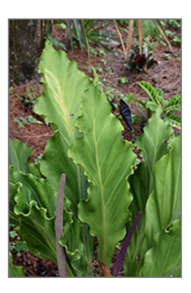
Fruffles Anthurium foliage

When grown indoors, Fruffles Anthurium can be expected to grow to be about 4 feet tall at maturity, with a spread of 18 inches. It grows at a medium rate, and under ideal conditions can be expected to live for approximately 5 years. This houseplant performs well in both bright or indirect sunlight and strong artificial light, and can therefore be situated in almost any well-lit room or location. It does best in average to evenly moist soil, but will not tolerate standing water. The surface of the soil shouldn't be allowed to dry out completely, and so you should expect to water this plant once and possibly even twice each week. Be aware that your particular watering schedule may vary depending on its location in the room, the pot size, plant size and other conditions; if in doubt, ask one of our experts in the store for advice. It is not particular as to soil pH, but grows best in rich soil. Contact the store for specific recommendations on pre-mixed potting soil for this plant. Be warned that parts of this plant are known to be toxic to humans and animals, so special care should be exercised if growing it around children and pets.