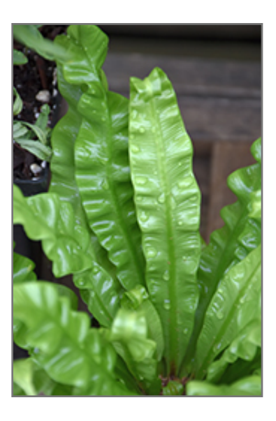
Crispy Wave Fern foliage

When grown indoors, Crispy Wave Fern can be expected to grow to be about 24 inches tall at maturity, with a spread of 18 inches. It grows at a slow rate, and under ideal conditions can be expected to live for approximately 15 years. This houseplant performs well in both bright or indirect sunlight and strong artificial light, and can therefore be situated in almost any well-lit room or location. It does best in average to evenly moist soil, but will not tolerate standing water. The surface of the soil shouldn't be allowed to dry out completely, and so you should expect to water this plant once and possibly even twice each week. Be aware that your particular watering schedule may vary depending on its location in the room, the pot size, plant size and other conditions; if in doubt, ask one of our experts in the store for advice. It is not particular as to soil pH, but grows best in rich soil. Contact the store for specific recommendations on pre-mixed potting soil for this plant.