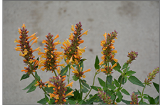
Kudos Gold Hyssop flowers