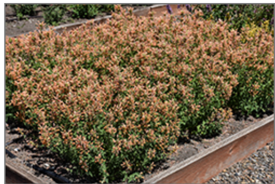
Kudos Gold Hyssop in bloom