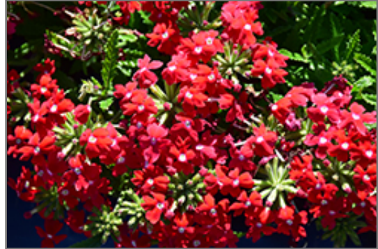
Obsession Cascade Red with Eye flowers

Obsession Cascade Red with Eye is recommended for the following landscape applications;