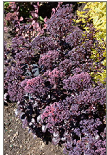
Dark Magic Stonecrop in bloom