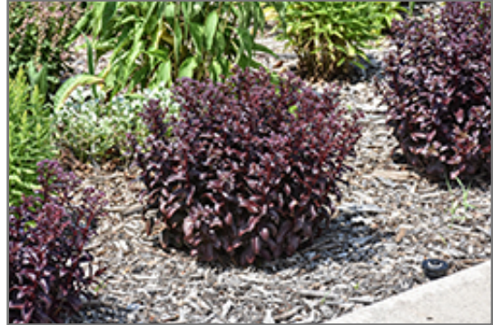
Dark Magic Stonecrop in bloom

Dark Magic Stonecrop will grow to be about 12 inches tall at maturity, with a spread of 20 inches. When grown in masses or used as a bedding plant, individual plants should be spaced approximately 16 inches apart. It grows at a fast rate, and under ideal conditions can be expected to live for approximately 15 years. As an herbaceous perennial, this plant will usually die back to the crown each winter, and will regrow from the base each spring. Be careful not to disturb the crown in late winter when it may not be readily seen!