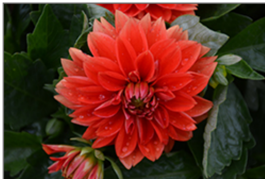
Lubega Power Orange Dahlia flowers

This wonderful series produces beautiful, large orange flowers that rise above green foliage; a compact, self cleaning selection, perfect for borders, garden landscapes and containers; double blooms are excellent for fresh cut arrangements