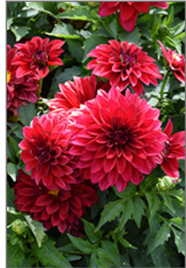
Lubega Power Red Dahlia flowers

Lubega Power Red Dahlia is recommended for the following landscape applications;