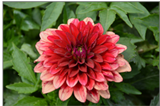
Lubega Power Red Dahlia flowers