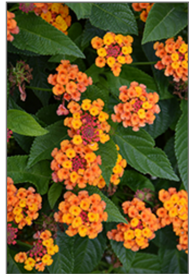
Gem Ruby Lantana flowers