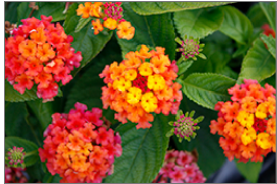
Gem Ruby Lantana flowers

Gem Ruby Lantana is recommended for the following landscape applications;