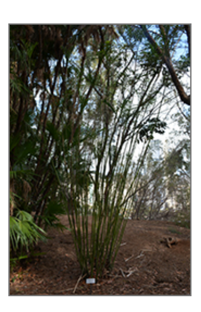
Reed Palm

There are many factors that will affect the ultimate height, spread and overall performance of a plant when grown indoors; among them, the size of the pot it's growing in, the amount of light it receives, watering frequency, the pruning regimen and repotting schedule. Use the information described here as a guideline only; individual performance can and will vary. Please contact the store to speak with one of our experts if you are interested in further details concerning recommendations on pot size, watering, pruning, repotting, etc.