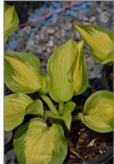
Lakeside Banana Bay Hosta foliage