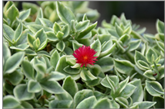
Variegated Baby Sun Rose flowers

Variegated Baby Sun Rose is recommended for the following landscape applications;