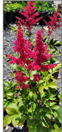
Elisabeth van Veen Astilbe in bloom