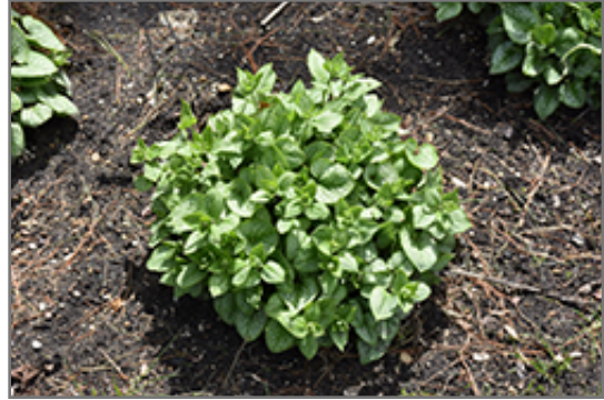
Jack of Diamonds Bugloss

Jack of Diamonds Bugloss will grow to be about 24 inches tall at maturity, with a spread of 30 inches. When grown in masses or used as a bedding plant, individual plants should be spaced approximately 28 inches apart. It grows at a medium rate, and under ideal conditions can be expected to live for approximately 10 years. As an herbaceous perennial, this plant will usually die back to the crown each winter, and will regrow from the base each spring. Be careful not to disturb the crown in late winter when it may not be readily seen!