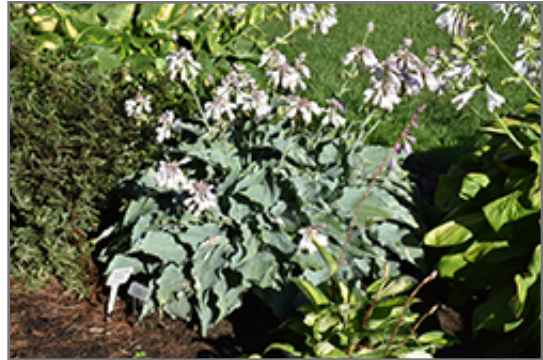
Dancing With Dragons Hosta in bloom

Dancing With Dragons Hosta is recommended for the following landscape applications;