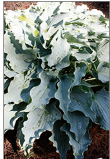
Dancing With Dragons Hosta foliage