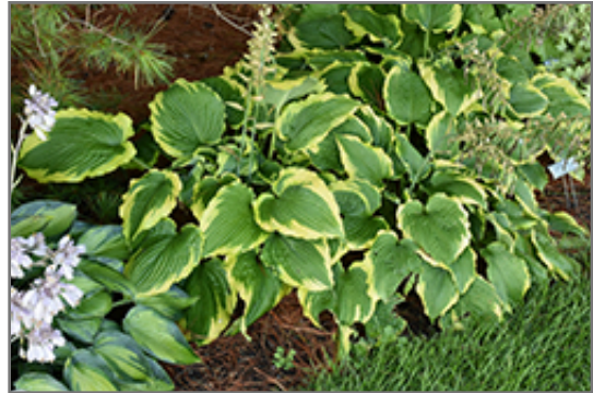
Spartacus Hosta

Spartacus Hosta is recommended for the following landscape applications;