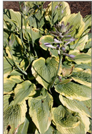
Spartacus Hosta in bloom