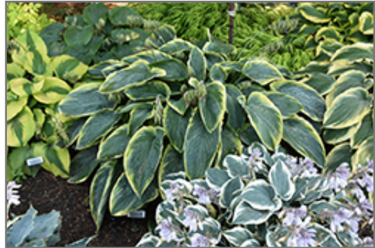
Shadowland Wu-La-La Hosta