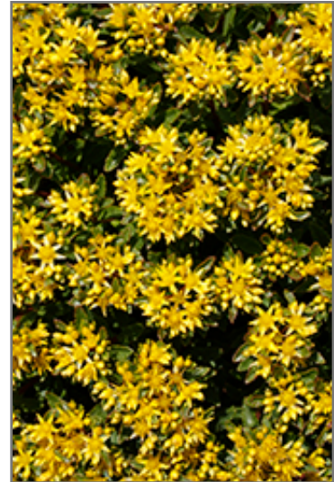
Rock 'N Round Bright Idea Stonecrop flowers

Rock 'N Round Bright Idea Stonecrop is recommended for the following landscape applications;