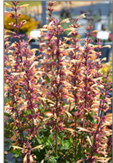
Meant To Bee Queen Nectarine Anise Hyssop flowers

Meant To Bee Queen Nectarine Anise Hyssop is recommended for the following landscape applications;