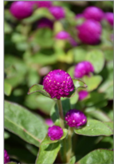
Gnome Purple Gomphrena flowers

Gnome Purple Gomphrena is recommended for the following landscape applications;