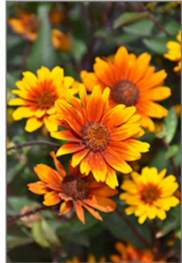
Summer Eclipse False Sunflower flowers

Summer Eclipse False Sunflower is recommended for the following landscape applications;