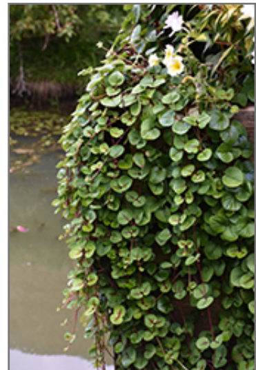
HILLIER Sunburst Moneywort