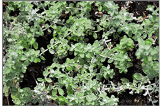
Minus Licorice Plant foliage