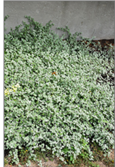
Silver Licorice Plant

Silver Licorice Plant is a fine choice for the garden, but it is also a good selection for planting in outdoor containers and hanging baskets. Because of its trailing habit of growth, it is ideally suited for use as a 'spiller' in the 'spiller-thriller-filler' container combination; plant it near the edges where it can spill gracefully over the pot. Note that when growing plants in outdoor containers and baskets, they may require more frequent waterings than they would in the yard or garden.