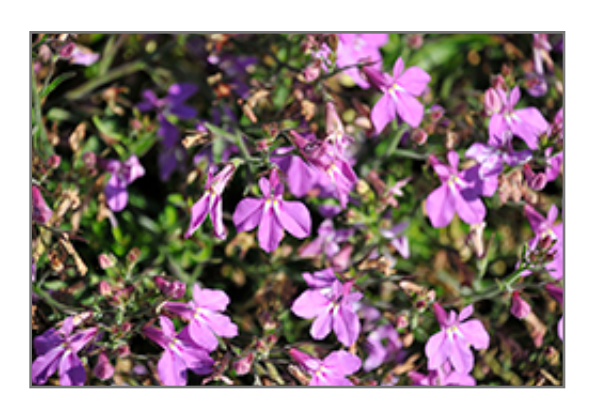
Hot+ Electric Purple Lobelia flowers

A wonderful heat tolerant and uniform series, showing excellent performance in garden beds and containers; heavy basal branching and long season flowering; larger, brighter and more vibrant blooms are presented over small green foliage