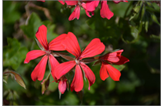
Minicascade Red Ivy Leaf Geranium flowers

Early blooming with a cascading habit, perfect for patio containers and hanging baskets; brightly colored blooms with excellent heat tolerance pop against lush green foliage; deadhead to encourage new growth throughout the season