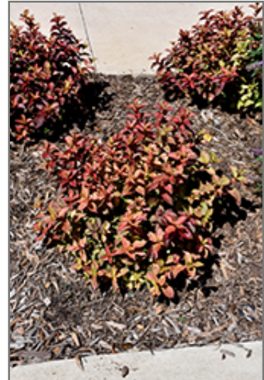
Midnight Sun Reblooming Weigela