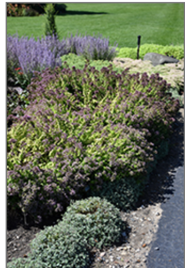
Drops of Jupiter Oregano in bloom