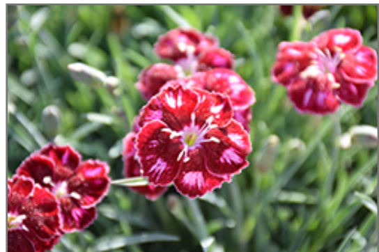
Mountain Frost Ruby Glitter Pinks flowers