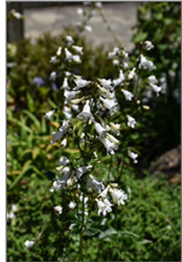
Foxglove Beardtongue flowers

Foxglove Beardtongue is recommended for the following landscape applications;