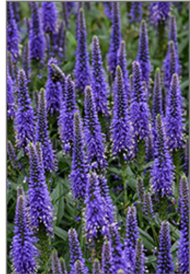
Skyward Blue Long-leaf Speedwell flowers

Skyward Blue Long-leaf Speedwell is recommended for the following landscape applications;