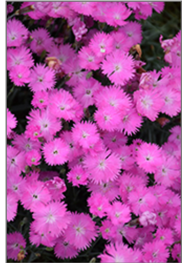
Firewitch Pinks flowers

Firewitch Pinks is recommended for the following landscape applications;