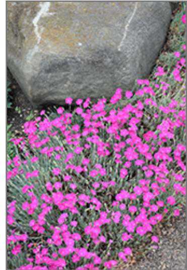
Firewitch Pinks in bloom

Firewitch Pinks is a fine choice for the garden, but it is also a good selection for planting in outdoor pots and containers. It is often used as a 'filler' in the 'spiller-thriller-filler' container combination, providing a mass of flowers and foliage against which the thriller plants stand out. Note that when growing plants in outdoor containers and baskets, they may require more frequent waterings than they would in the yard or garden.