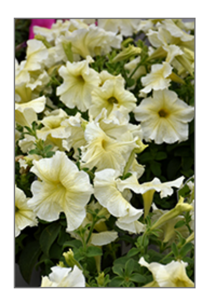
Prism Sunshine Petunia flowers