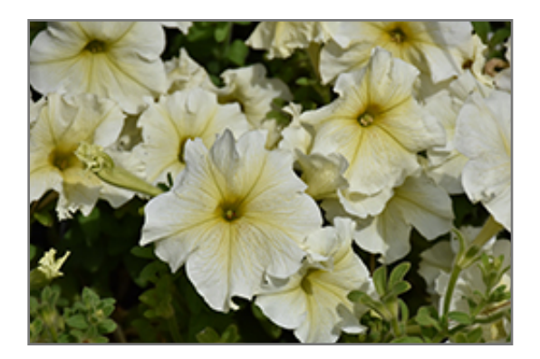
Prism Sunshine Petunia flowers

Prism Sunshine Petunia is recommended for the following landscape applications;