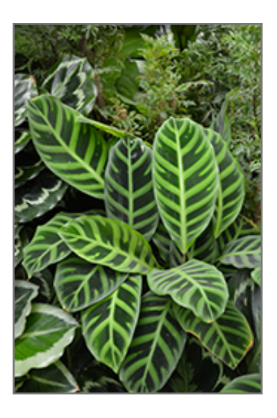
Zebra Plant foliage

When grown indoors, Zebra Plant can be expected to grow to be about 3 feet tall at maturity, with a spread of 24 inches. It grows at a slow rate, and under ideal conditions can be expected to live for approximately 5 years. This houseplant should only be grown away from direct sunlight or in a room with strong artificial light. It does best in average to evenly moist soil, but will not tolerate standing water. The surface of the soil shouldn't be allowed to dry out completely, and so you should expect to water this plant once and possibly even twice each week. Be aware that your particular watering schedule may vary depending on its location in the room, the pot size, plant size and other conditions; if in doubt, ask one of our experts in the store for advice. It will benefit from a regular feeding with a general-purpose fertilizer with every second or third watering. It is not particular as to soil pH, but grows best in rich soil. Contact the store for specific recommendations on pre-mixed potting soil for this plant.