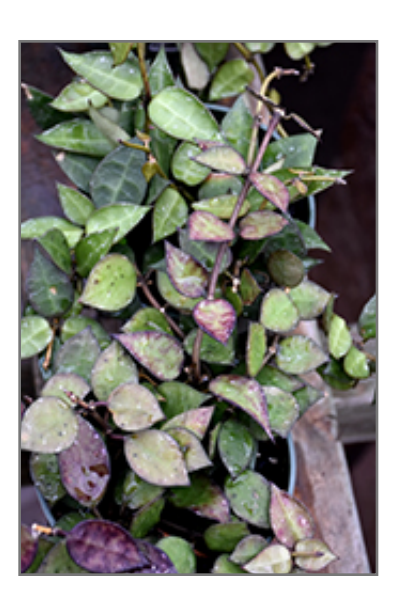
Hoya Krohniana foliage

When grown indoors, Hoya Krohniana can be expected to grow to be about 6 feet tall at maturity, with a spread of 24 inches. It grows at a medium rate, and under ideal conditions can be expected to live for approximately 10 years. This houseplant should be situated in a location that that gets indirect sunlight at most, although it will usually require a more brightly-lit environment than what artificial indoor lighting alone can provide. It is very adaptable to both dry and moist soil, but will not tolerate any standing water. The surface of the soil shouldn't be allowed to dry out completely, and so you should expect to water this plant once and possibly even twice each week. Be aware that your particular watering schedule may vary depending on its location in the room, the pot size, plant size and other conditions; if in doubt, ask one of our experts in the store for advice. It is not particular as to soil pH, but grows best in rich soil. Contact the store for specific recommendations on pre-mixed potting soil for this plant.