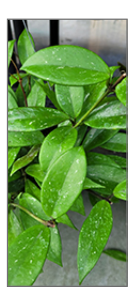
Hoya Pubicalyx foliage

When grown indoors, Hoya Pubicalyx can be expected to grow to be about 6 feet tall at maturity, with a spread of 24 inches. It grows at a medium rate, and under ideal conditions can be expected to live for approximately 10 years. This houseplant should be situated in a location that that gets indirect sunlight at most, although it will usually require a more brightly-lit environment than what artificial indoor lighting alone can provide. It is very adaptable to both dry and moist soil, but will not tolerate any standing water. The surface of the soil shouldn't be allowed to dry out completely, and so you should expect to water this plant once and possibly even twice each week. Be aware that your particular watering schedule may vary depending on its location in the room, the pot size, plant size and other conditions; if in doubt, ask one of our experts in the store for advice. It will benefit from a regular feeding with a general-purpose fertilizer with every second or third watering. It is not particular as to soil pH, but grows best in rich soil. Contact the store for specific recommendations on pre-mixed potting soil for this plant.