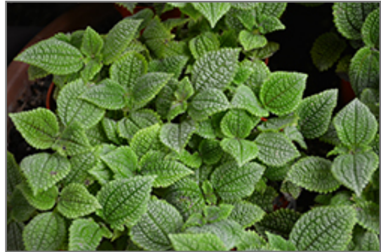
Moon Valley Pilea foliage

This is a dense herbaceous evergreen houseplant with a mounded form. Its relatively fine texture sets it apart from other indoor plants with less refined foliage. This plant can be pruned at any time to keep it looking its best.