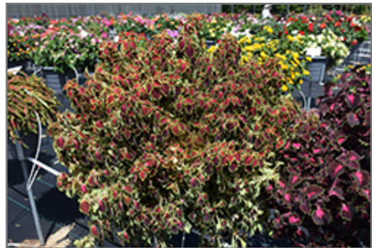
TrailBlazer Glory Road Coleus