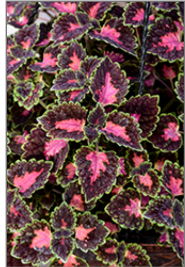
TrailBlazer Road Trip Coleus foliage

TrailBlazer Road Trip Coleus is recommended for the following landscape applications;