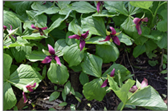
Red Trillium flowers

Other Names: Red Wakerobin, Purple Wakerobin