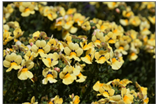
Nesia Inca Nemesia flowers