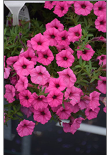
Supertunia Mini Vista Hot Pink Petunia flowers

Supertunia Mini Vista Hot Pink Petunia is recommended for the following landscape applications;