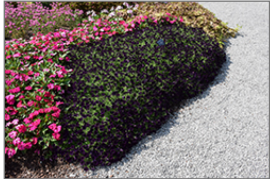
Supertunia Mini Vista Midnight Petunia in bloom

Supertunia Mini Vista Midnight Petunia is a fine choice for the garden, but it is also a good selection for planting in outdoor containers and hanging baskets. Because of its trailing habit of growth, it is ideally suited for use as a 'spiller' in the 'spiller-thriller-filler' container combination; plant it near the edges where it can spill gracefully over the pot. Note that when growing plants in outdoor containers and baskets, they may require more frequent waterings than they would in the yard or garden.