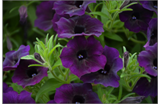
Supertunia Mini Vista Midnight Petunia flowers

This plant will require occasional maintenance and upkeep. Trim off the flower heads after they fade and die to encourage more blooms late into the season. It is a good choice for attracting butterflies and hummingbirds to your yard, but is not particularly attractive to deer who tend to leave it alone in favor of tastier treats. It has no significant negative characteristics.