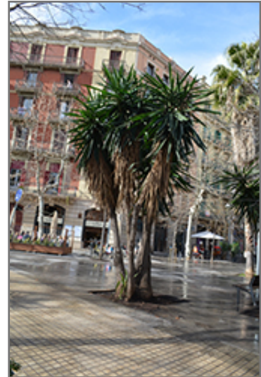
Mountain Cabbage Tree