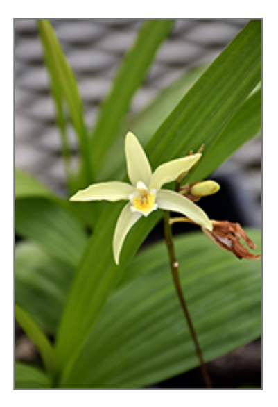
Lavender Japanese Hyacinth Orchid flowers

When grown indoors, Lavender Japanese Hyacinth Orchid can be expected to grow to be about 18 inches tall at maturity extending to 24 inches tall with the flowers, with a spread of 12 inches. It grows at a medium rate, and under ideal conditions can be expected to live for approximately 10 years. This houseplant will do well in a location that gets either direct or indirect sunlight, although it will usually require a more brightly-lit environment than what artificial indoor lighting alone can provide. It does best in average to evenly moist soil, but will not tolerate standing water. The surface of the soil shouldn't be allowed to dry out completely, and so you should expect to water this plant once and possibly even twice each week. Be aware that your particular watering schedule may vary depending on its location in the room, the pot size, plant size and other conditions; if in doubt, ask one of our experts in the store for advice. It does not require much in the way of fertilizing once established. It is not particular as to soil type or pH; an average potting soil should work just fine.