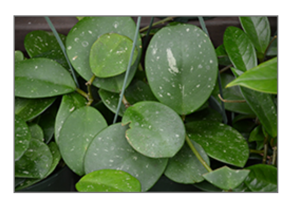
Hoya obovata foliage

When grown indoors, Hoya obovata can be expected to grow to be about 6 feet tall at maturity, with a spread of 24 inches. It grows at a medium rate, and under ideal conditions can be expected to live for approximately 10 years. This houseplant should be situated in a location that that gets indirect sunlight at most, although it will usually require a more brightly-lit environment than what artificial indoor lighting alone can provide. It is very adaptable to both dry and moist soil, but will not tolerate any standing water. The surface of the soil shouldn't be allowed to dry out completely, and so you should expect to water this plant once and possibly even twice each week. Be aware that your particular watering schedule may vary depending on its location in the room, the pot size, plant size and other conditions; if in doubt, ask one of our experts in the store for advice. It will benefit from a regular feeding with a general-purpose fertilizer with every second or third watering. It is not particular as to soil pH, but grows best in rich soil. Contact the store for specific recommendations on pre-mixed potting soil for this plant.