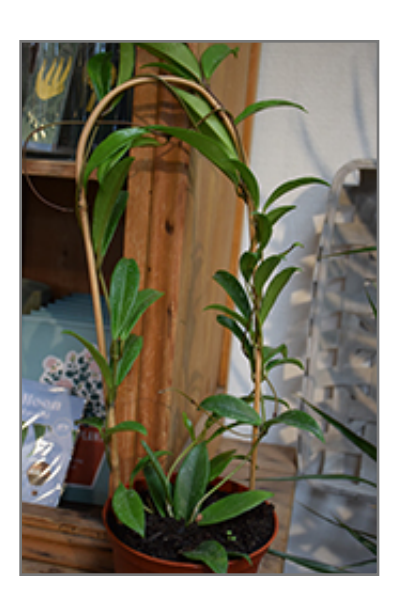
Splash Hoya in full

When grown indoors, Splash Hoya can be expected to grow to be about 6 feet tall at maturity, with a spread of 24 inches. It grows at a medium rate, and under ideal conditions can be expected to live for approximately 10 years. This houseplant should be situated in a location that that gets indirect sunlight at most, although it will usually require a more brightly-lit environment than what artificial indoor lighting alone can provide. It is very adaptable to both dry and moist soil, but will not tolerate any standing water. The surface of the soil shouldn't be allowed to dry out completely, and so you should expect to water this plant once and possibly even twice each week. Be aware that your particular watering schedule may vary depending on its location in the room, the pot size, plant size and other conditions; if in doubt, ask one of our experts in the store for advice. It will benefit from a regular feeding with a general-purpose fertilizer with every second or third watering. It is not particular as to soil pH, but grows best in rich soil. Contact the store for specific recommendations on pre-mixed potting soil for this plant.