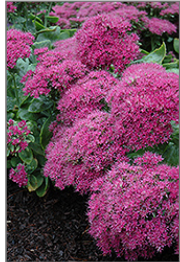
Neon Stonecrop flowers

This is a relatively low maintenance plant, and is best cleaned up in early spring before it resumes active growth for the season. It is a good choice for attracting bees and butterflies to your yard, but is not particularly attractive to deer who tend to leave it alone in favor of tastier treats. It has no significant negative characteristics.